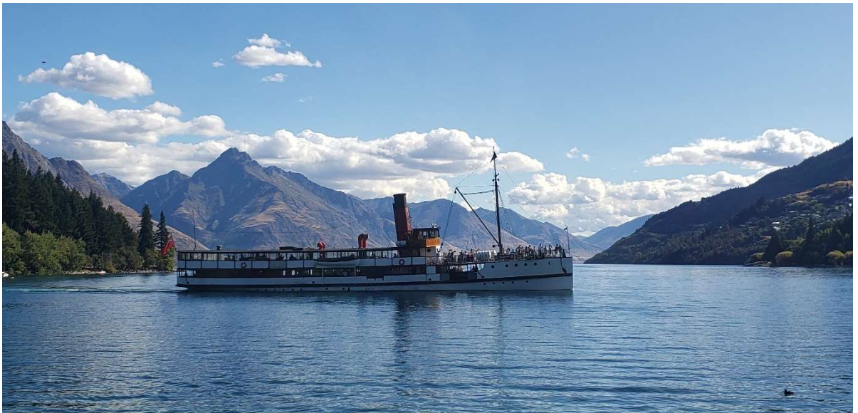
Real Journeys Limited - TSS Earnslaw and Walter Peak - Strategic Tourism Asset Protection Programme (STAPP).