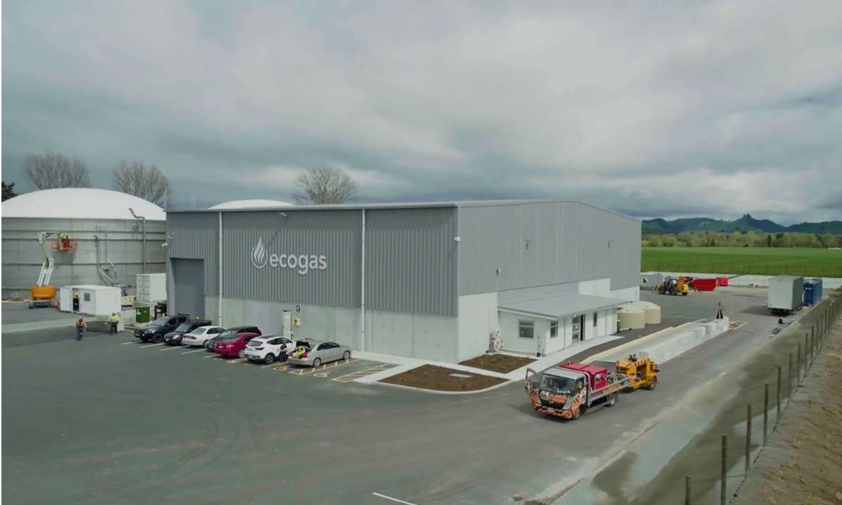
The Ecogas Reporoa Organics Processing Facility (PGF Funding)